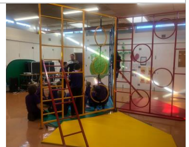
Y6 Gymnastics this week